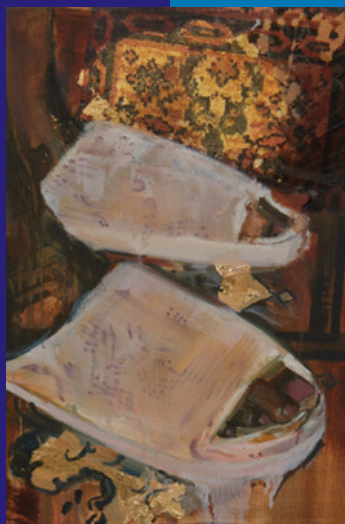
Presented by the Contemporary Art Society, 2023/2024. Courtesy of the Artist and Tiwani Contemporary.