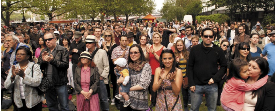
Photograph by Edurne Aginanga - 2012