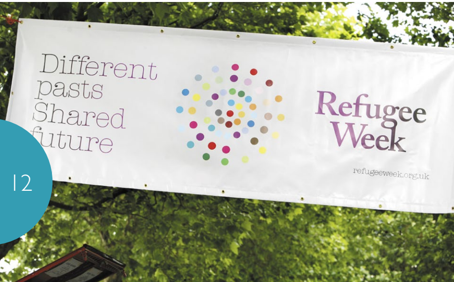
Photograph by Nana Varveropoulou - 2009

Inspired Productions presents spoken word pieces devised and performed by refugees and asylum seekers from Rossendale and Burnley, comparing sensory experiences in their home countries and in the UK. View the performances on the Inspired Productions Facebook page .