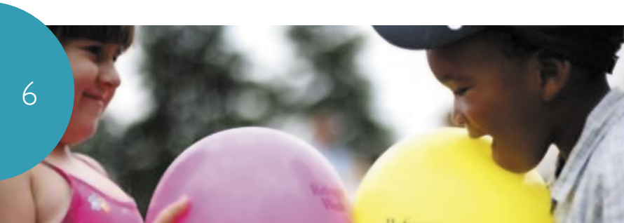
Children with balloons